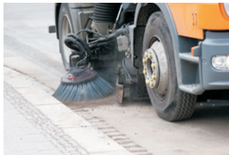
Street cleaning/snow clearance